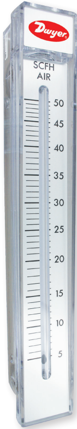
Model RMC 10" scale, 15-3/8" high