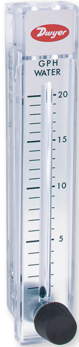
Model RMB-SSV 5" scale, 8-3/4" high