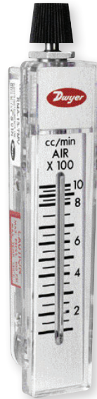
Model RMA-TMV 2" scale, 4-13/16" high