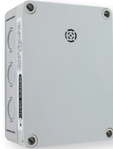
Wall mount without LCD