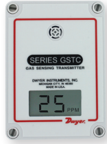
Wall mount with LCD